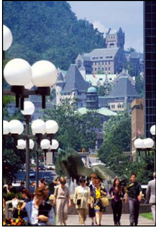
Photo: McGill University, Royal Victoria Hospital, and Mount Royal in Montreal, Canada.

SCUP-43 July 19-23, 2008 Montreal, QC (Canada) "Discover! Global Perspectives, Local Strategies"